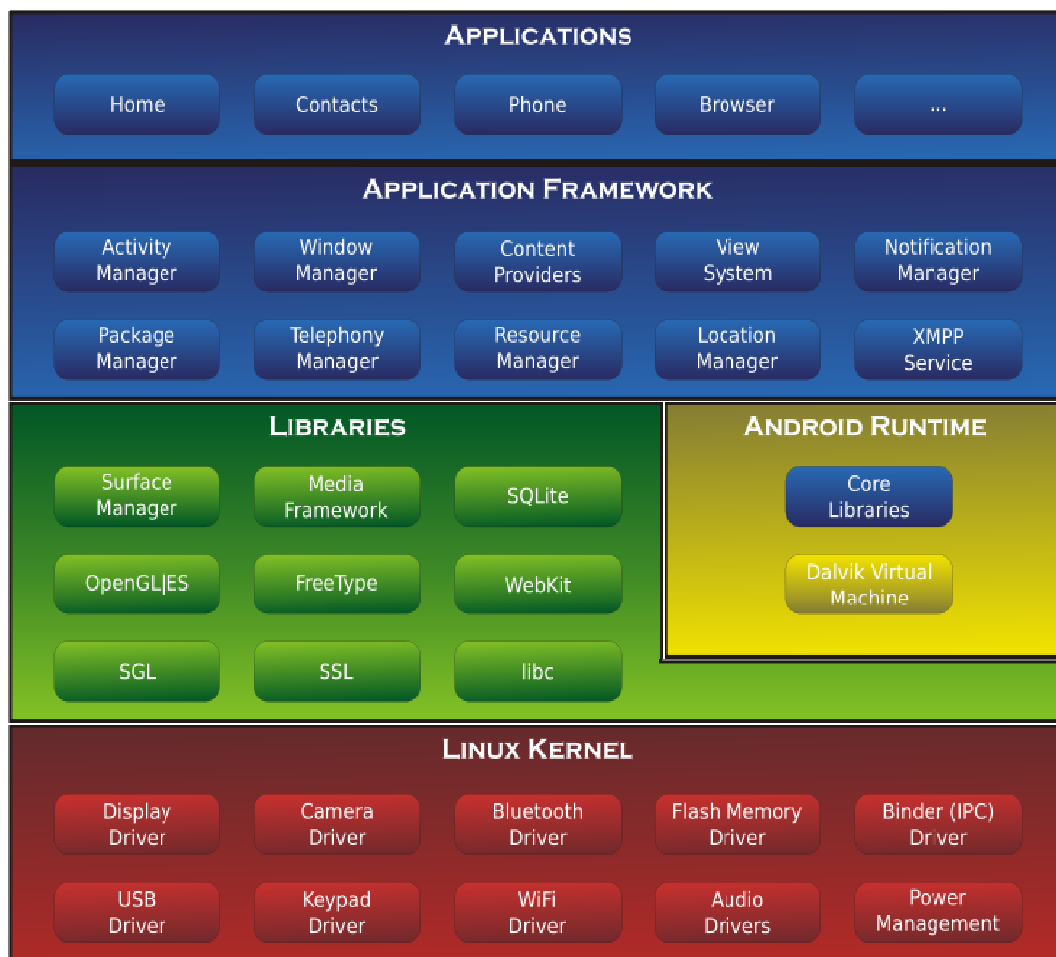
Fig 1.2 Android system Architecture

Any app can be developed according to the above architecture and can be used to control any hardware peripherals.